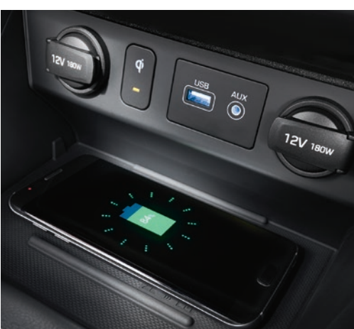
Available wireless charging pad<sup>4</sup>