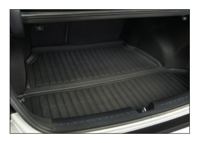
Premium All-Weather Cargo Tray

Keep the inside of your car warm in winter months without using a drop of fuel! The Hyundai WarmUp System includes an interior cabin heater and a fully programmable display unit as well as an integrated battery charger.