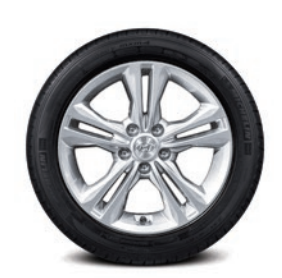
17" alloy wheel Standard on 2.4 Sport, GLS, GLS Tech and Limited models