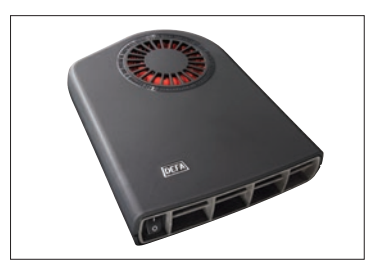
Hyundai WarmUp System

Premium all-weather floor liners were designed to cover the interior carpet, providing maximum protection against the elements that other mats cannot offer. Their unique and durable design features a non-slip surface for added comfort and a long-lasting premium look. Remove carpet mats prior to installation.