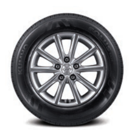
16" alloy wheel Standard on GL model