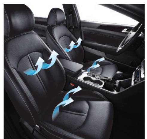
Available ventilated front seats