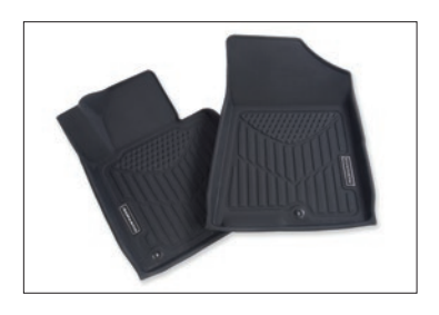
Premium All-Weather Floor Liners

Premium all-weather floor liners were designed to cover the interior carpet, providing maximum protection against the elements that other mats cannot offer. Their unique and durable design features a non-slip surface for added comfort and a long-lasting premium look. Remove carpet mats prior to installation.