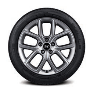
18" alloy wheel Standard on 2.0T Sport model

Choice of interior colour depends upon model and/or exterior colour selection. Interior colour swatches may not be exactly as shown. Colours shown are for reference only and may vary from the actual hue and appearance. Visit hyundaicanada.com, or see your dealer for details.